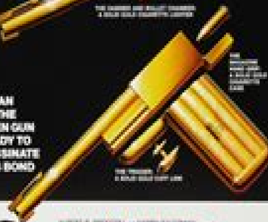
THE TRIGGER: A SOLID GOLD CUFF LINK

THE MAN WITH THE GOLDEN GUN IS READY TO ASSASSINATE JAMES BOND