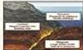
Diagram of a foliated rock formation showing layers of rock being deformed and folded.

Foliated rocks are metamorphic rocks that have a layered or banded appearance. They are the most common type of metamorphic rock on Earth.