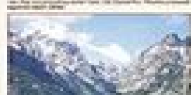
Photograph of a foliated rock formation showing layers of rock being deformed and folded.