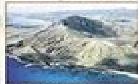
Photograph of a volcano with smoke rising from the vent.