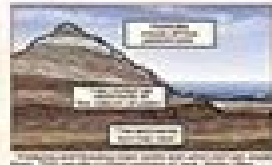
Diagram of a sedimentary rock formation showing layers of sediment being deposited and compacted.

Sedimentary rocks are formed from sediments that have been compacted and cemented together. They are the most common type of rock on Earth.