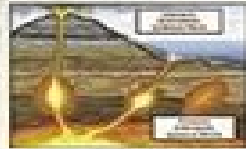
Diagram of a volcano showing magma rising from the mantle and erupting from the vent.

Volcanic rocks are igneous rocks that are formed from molten material that has cooled and solidified on the Earth's surface. They are the most common type of igneous rock on Earth.