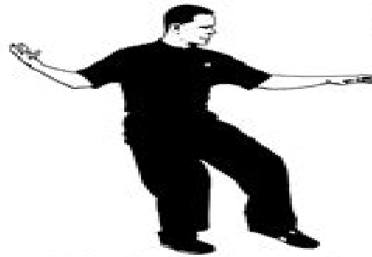
5. Monkey Retreats x4