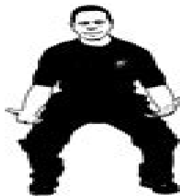
7. Carry The Cauldron