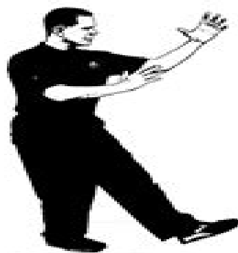
4. Strum The Lute