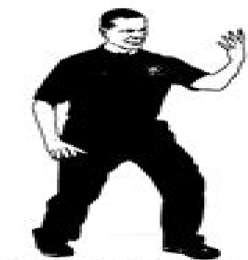
2. Wild Horse x3