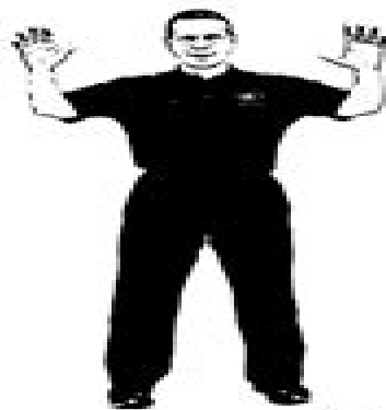
1. Rise & Fall