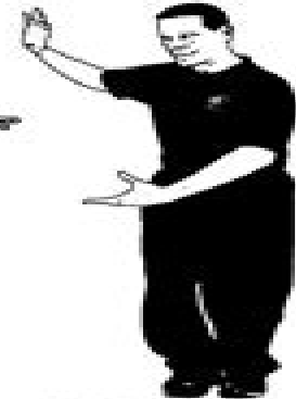
6. Cloud Hands x3