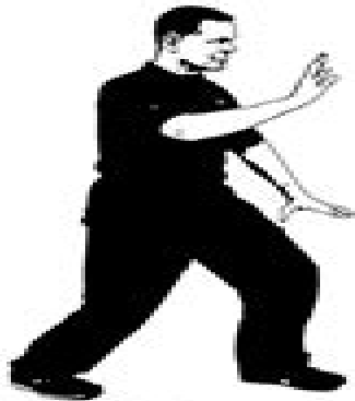
3. Brush Knee x3