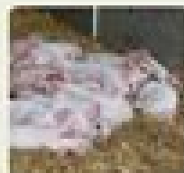
Erntebildung auf dem Feld

Der Ökolandbau fördert durch vielfältige Fruchtfolgen mit Zwischenfruchtanbau die biologische Vielfalt von Pflanzen und Tieren in der Agrarlandschaft.