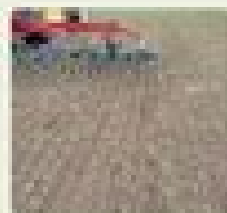
Traktorfahrt auf dem Feld