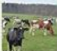
Bildung für die Wirtschaftsprüfung

Der Ökolandbau setzt bei der Schädlingsbekämpfung auf die Hilfe von Nützlingen, wie etwa Schlupfwespen. Diese werden vermehrt und in von Schädlingen (zum Beispiel Läuse, Weißen Fliegen) befallenen Kulturen wie Gurken und Tomaten ausgesetzt. Im Gewächshaus funktioniert das besonders gut.