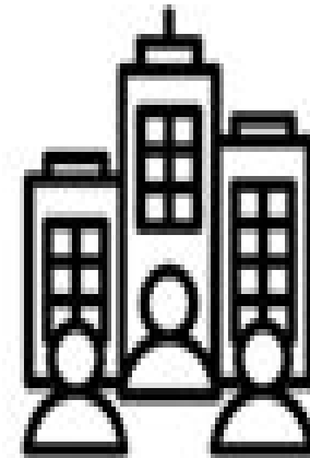
Individuals, business entities, nonprofit organizations, or government entities

A CPA or CA from a public accounting firm or self employed