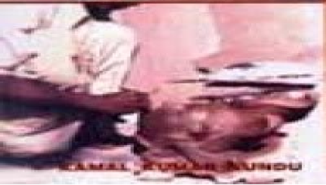
KANAL PUNAM NUNDU