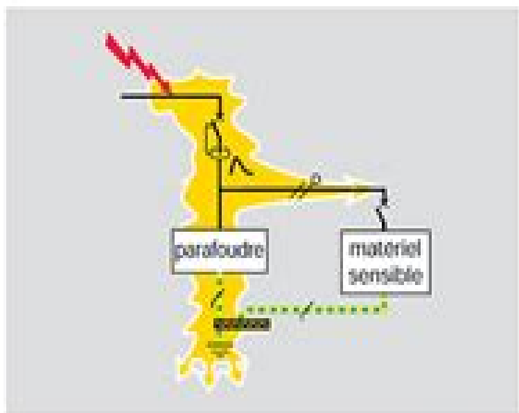
schéma 3 : écoulement de "l'énergie foudre" à la terre