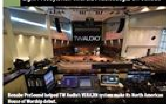
Audio Project helped FM install WYALDORF system in North American House of Worship.

With a seating capacity of 2,000, Light Presbyterian Church in Mississauga is a Gospel-centered church that serves a multi-ethnic and multi-generational community.