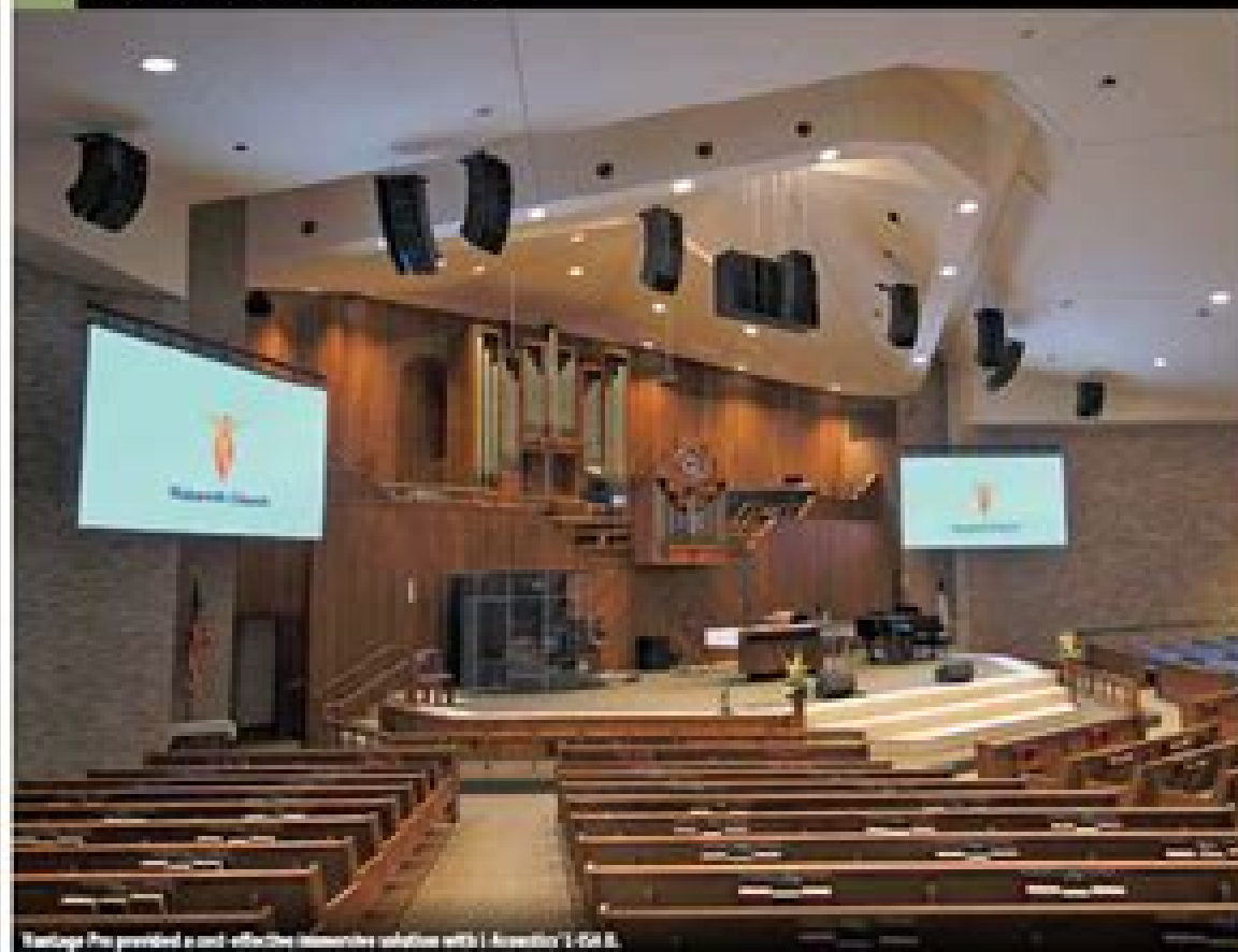
Vantage Pro provided a cost-effective immersive solution with L-Acoustics L-ISA II.

Established in 1871, Nazareth Lutheran Church has undergone various changes over its past 150 years. Like many other houses of worship, one of those updates was a choice to host both traditional choir/organ and contemporary worship services on Sundays to better cater to parishioners' preferences in worship style.