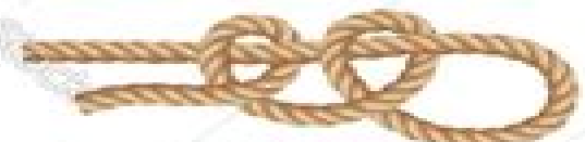
Two Half Hitches