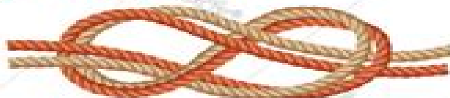
Figure Eight Double