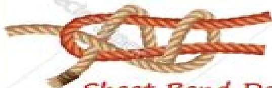
Sheet Bend Double