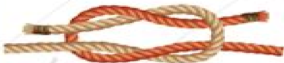
Square (Reef) Knot