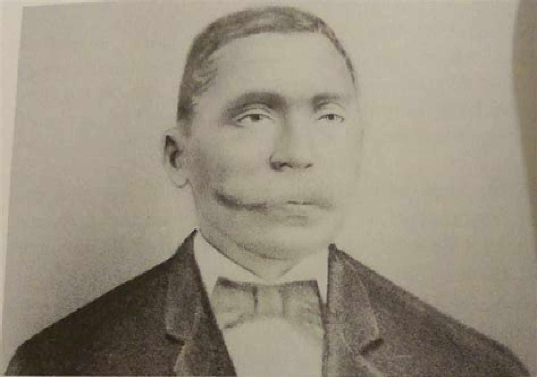
The Sleeping Preacher