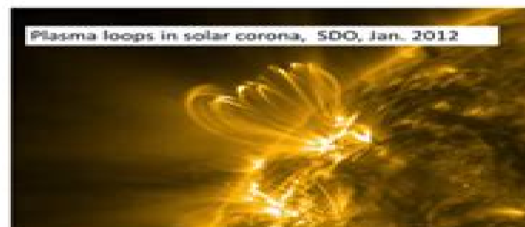
Plasma loops in solar corona, SDO, Jan. 2012