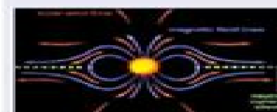
Properties of IMF