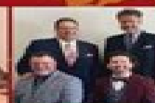
FORT CITY QUARTET