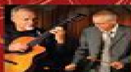
THE BURCHFIELD BROTHERS