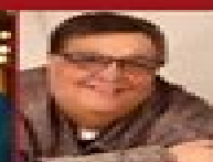
BIG MO & FAMILY