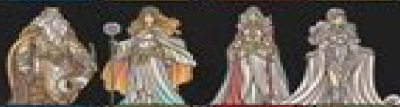
DEDEKHOZ LADA ZORYA MOKOSH