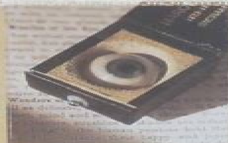
Wooden Case of the Skull