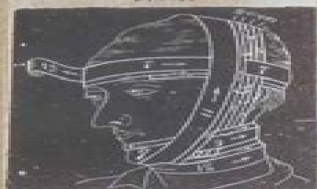
Wooden Case of the Skull