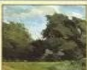
Húmedo sobre seco