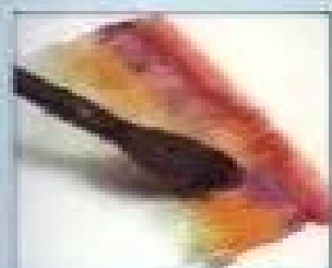
Húmedo sobre húmedo