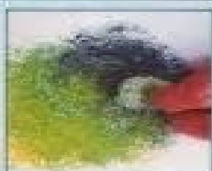
Pintura con esponja