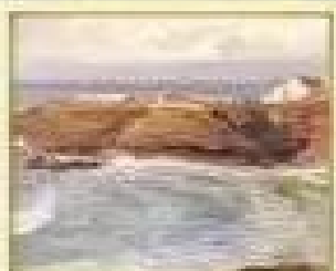
Reservas con cera