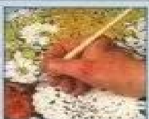
Extracción de pintura