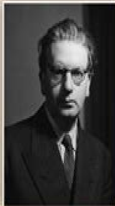
John Logie Baird