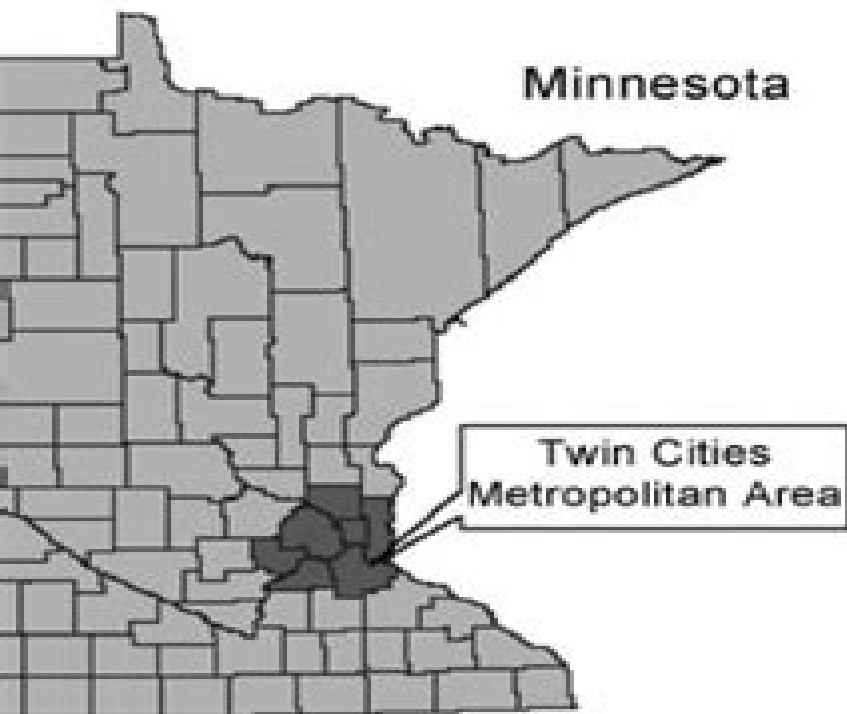
Twin Cities Metropolitan Area