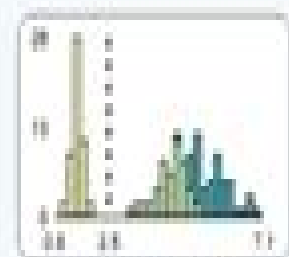
period length (year)