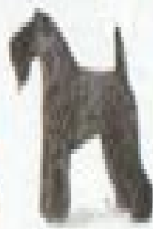
Kerry Blue Terrier