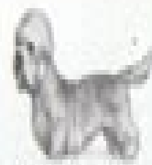
Double Diamond Terrier