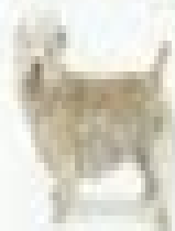
Glen of Innes Terrier