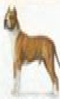
American Staffordshire Terrier