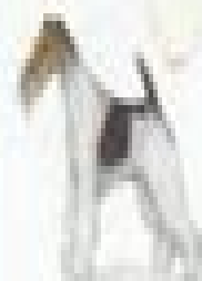
Fox Terrier Wire