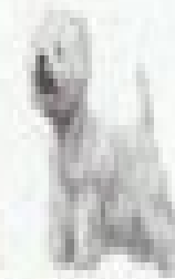
West Highland White Terrier