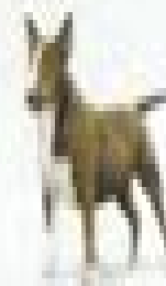
Miniature Bull Terrier