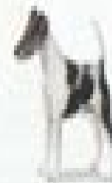
Fox Terrier Smooth