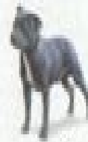
Staffordshire Bull Terrier