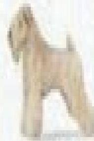
Salt Coated Wheaton Terrier