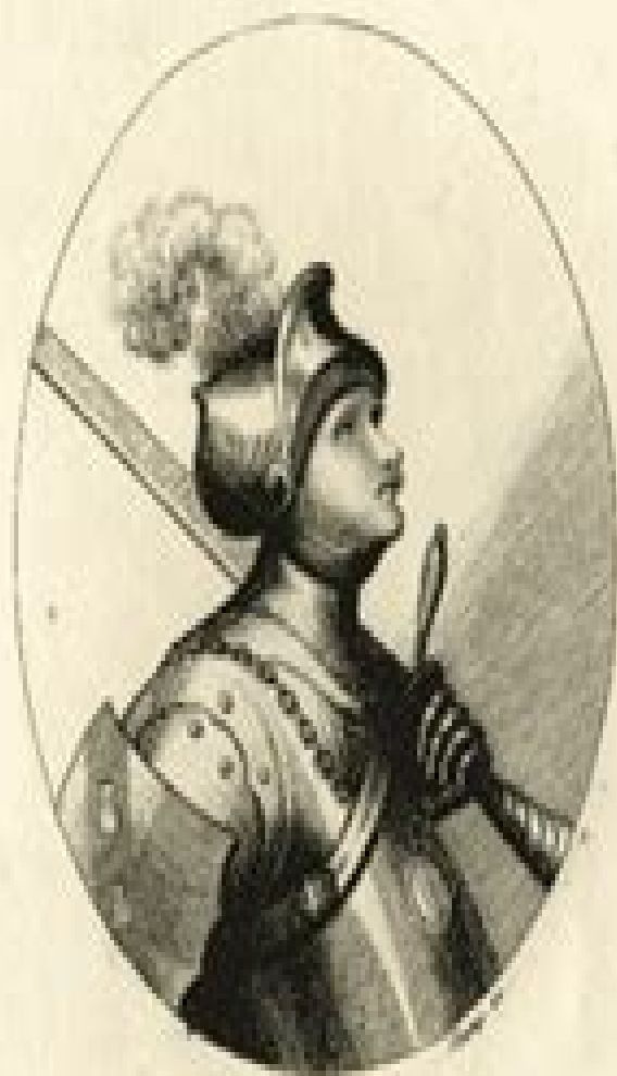
St. John Tustolfe

From the Oxford Almanack for the Year 1730.