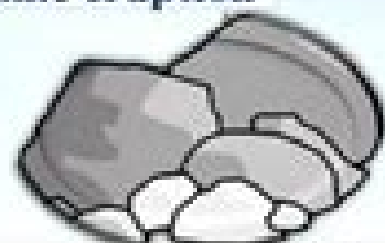
Weathering of rocks