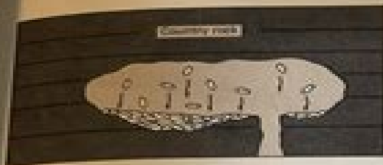
Fig. 7-30 Bowen's theory for separating crystals from a magma. Settling of first-formed, high-temperature olivine crystals to the bottom of a magma chamber.

cooling magma, the remaining liquid would change to a more felsic and silica-rich composition. Bowen suggested that a natural separation of crystals from a melt would occur in a magma chamber (Fig. 7-30). Here, the progressively forming crystals could settle to the bottom and thus be removed from