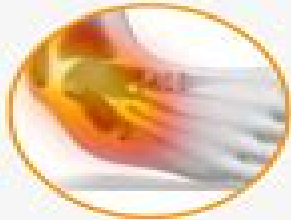
Sprains and Strains