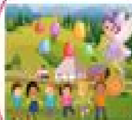
The Great Adventure of the Bubblegum Fairy