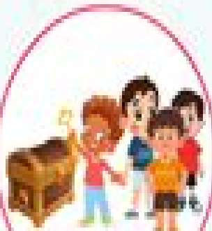
The Quest for the Golden Key