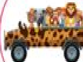
The Silly Safari