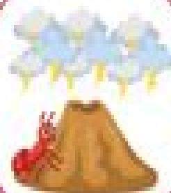
The Tale of the Brave Little Ant