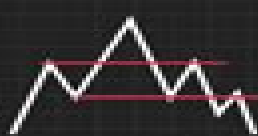
Head & Shoulder