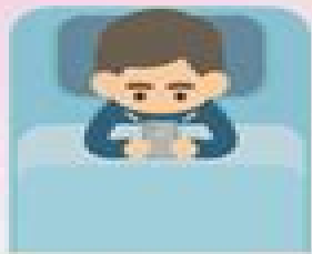
Poor Sleep Habits