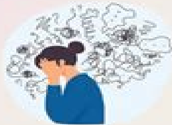
Stress and Anxiety