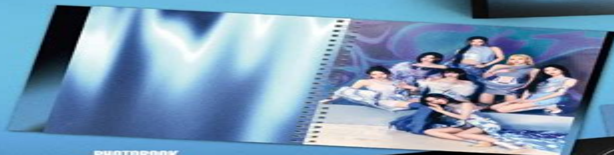
PHOTOBOK (70p / 170*230*15 mm)