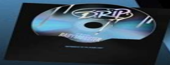
CD (120*120 mm)