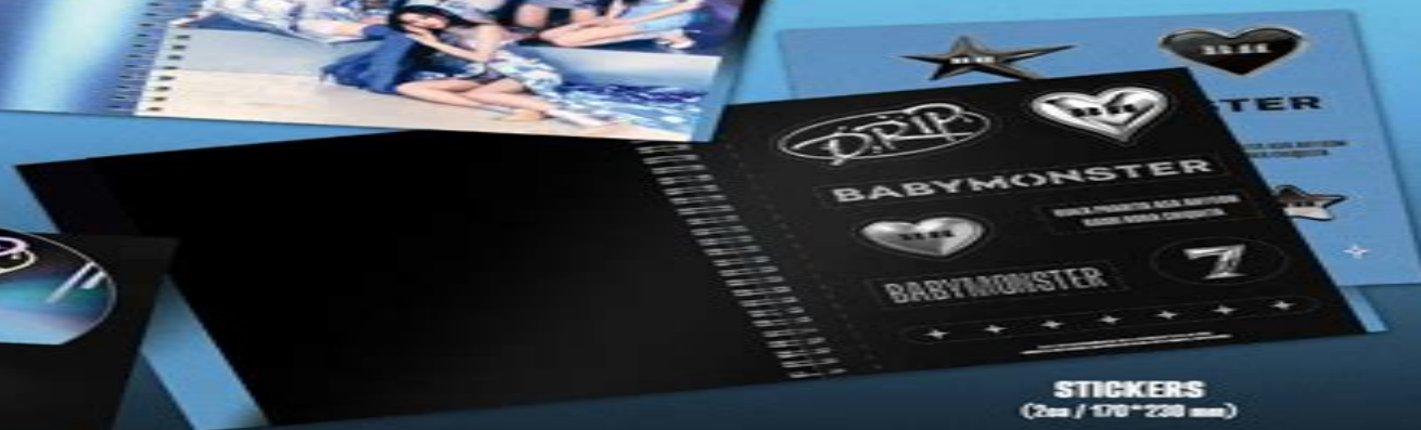
STICKERS (2ea / 170*230 mm)