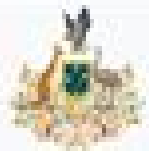
Coat of arms