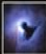
Reflection nebula NGC 1999

Our galaxy is filled with beautiful clouds of glowing gas and dust called nebulae. They are the stuff stars are made of and the place where stars are born. Some nebulae are so bright that they glow with their own light, while others are so dark that they are only visible if they block the light of stars or brighter nebulae behind them.