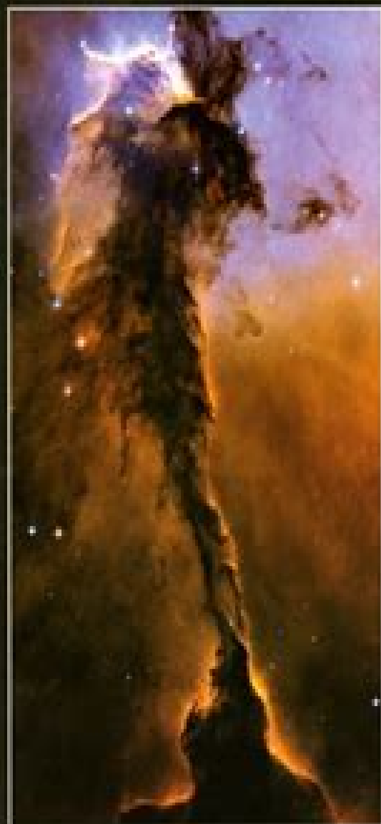
NGC 604 nebula

This nebula is a large, complex one. It has a bright red central core and a blue outer ring. The gas and dust in the nebula are so dark that they are only visible if they block the light of stars or brighter nebulae behind them.