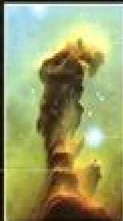
NGC 604 nebula

This nebula is a large, complex one. It has a bright red central core and a blue outer ring. The gas and dust in the nebula are so dark that they are only visible if they block the light of stars or brighter nebulae behind them.