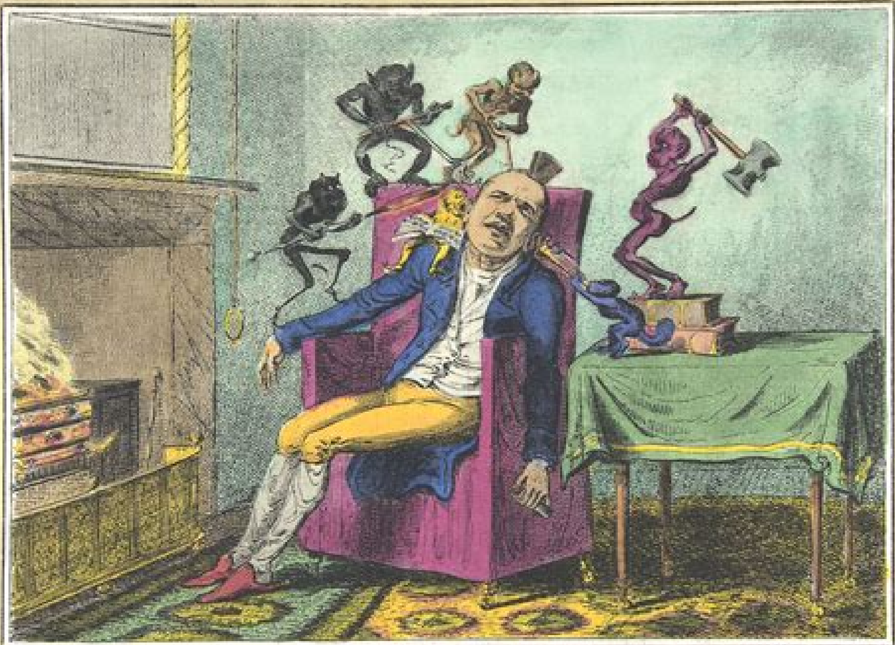
The Head ache