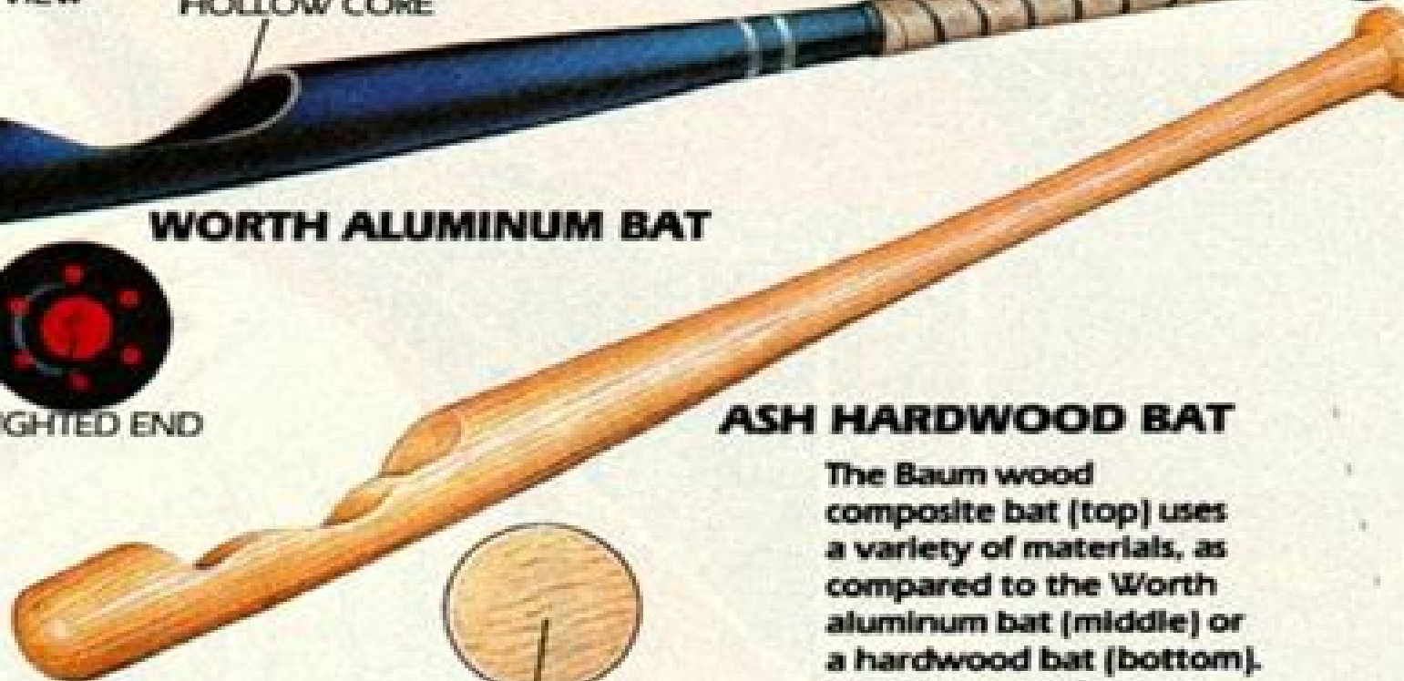
ASH HARDWOOD BAT