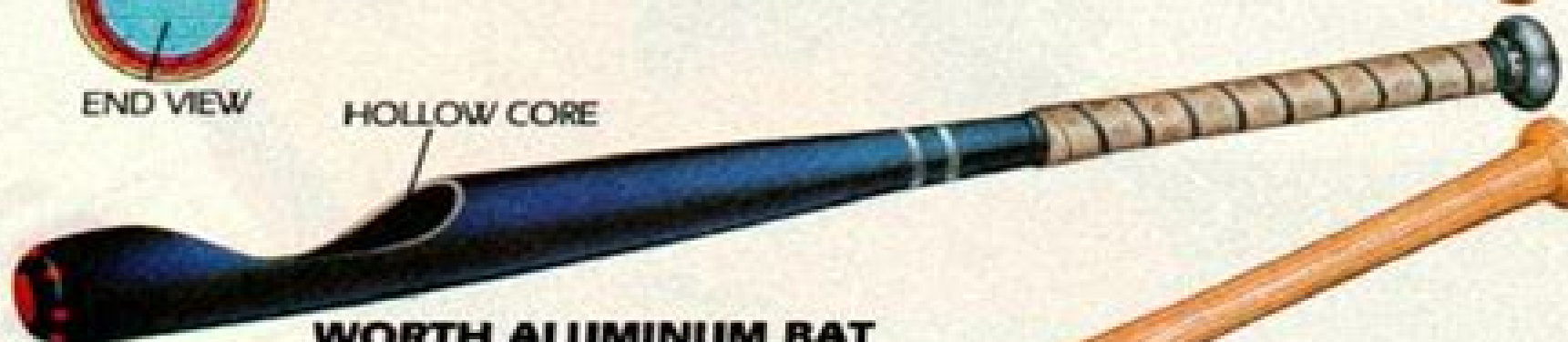
WORTH ALUMINUM BAT