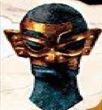
Bronze and gold head from Harappan