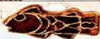
Monolingian metal brooch