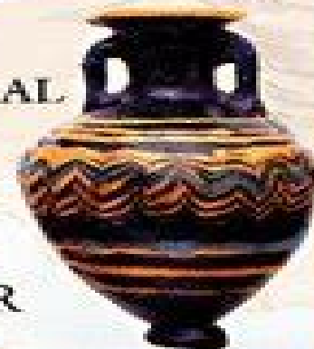
Phoenician glass vase

MICK ASTON & TIM TAYLOR FROM CHANNEL 4'S TIME TEAM