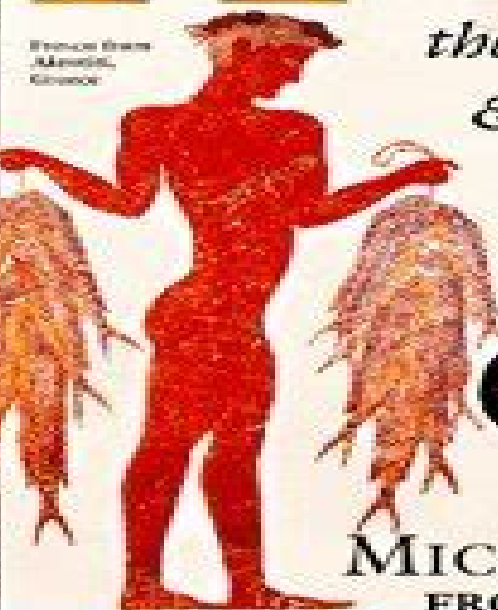
France from Harappan Greece