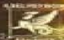
Illustration: © 1992 by Linda S. Galt