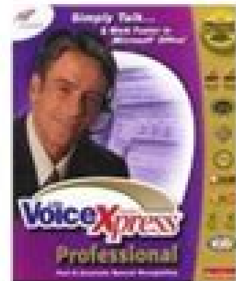
L&H Voice Express