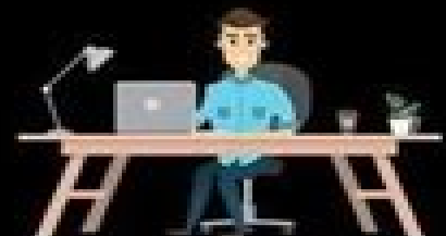
IMPLEMENTING WHAT YOU LEARN