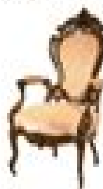
Revival Furniture 1800-1900AD