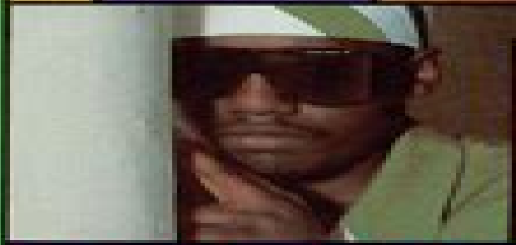
KOOL MOE DEE