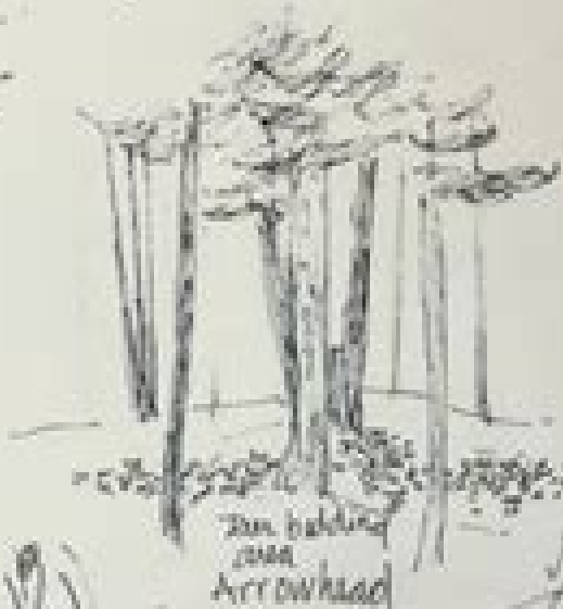
San holding area Arrowhead