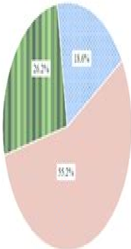
Environmental Price Cost