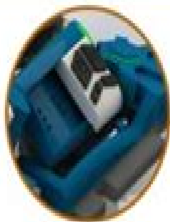
Swappable face button and trigger button pads