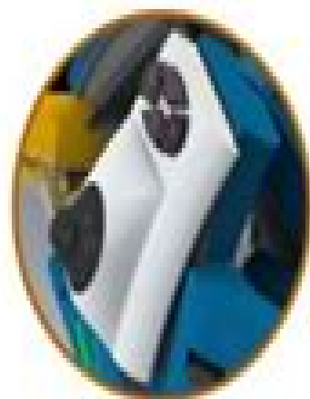
Swappable Thumbstick Pad