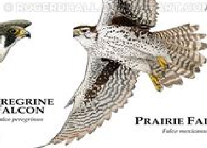
PRAIRIE FALCON Falco mexicanus