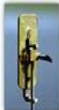
Antonie van Leeuwenhoek

Developed the microscope with single lens