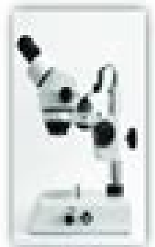
Davidovits and Igger

Invented the confocal scanning optical microscope