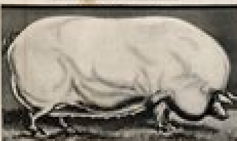
IMPROVED SUFFOLK HOG

Illustrated of all commercial pig breeds, and the contrast of ancient types with the modern baconer.