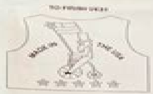
FRONT VEST (CUTTING)

1. Cut out the pieces of fabric and paper patterns. 2. Sew the pieces of fabric together to make the vest. 3. Sew the pieces of fabric together to make the vest. 4. Sew the pieces of fabric together to make the vest. 5. Sew the pieces of fabric together to make the vest. 6. Sew the pieces of fabric together to make the vest. 7. Sew the pieces of fabric together to make the vest. 8. Sew the pieces of fabric together to make the vest. 9. Sew the pieces of fabric together to make the vest. 10. Sew the pieces of fabric together to make the vest.