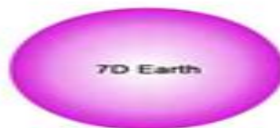
Magnetic Repulsion Zone