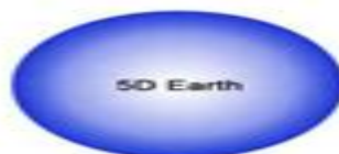
Magnetic Repulsion Zone