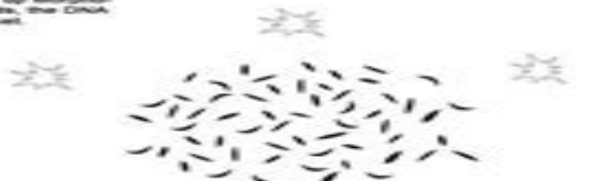
CRADLE OF LYRA Original Seeding of Human's and Planetary Explosion

Structured bands of EMF light-sound-tone (vocal waves) make up Morpho- genetic Fields, the DNA Instruction Set.