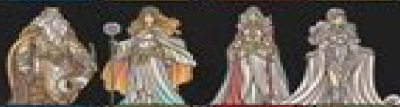
DABROGO | LADA | ZORYA | MOKOSH