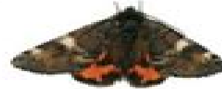
Light Orange Underwing Moth