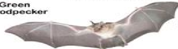
Greater Horseshoe Bat