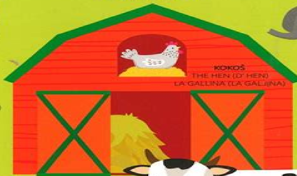
KOKOŠ THE HEN (D' HEN) LA GALLINA (LA GALLINA)