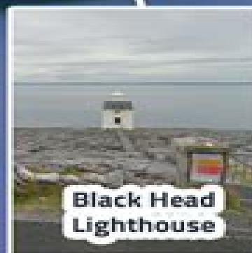
Black Head Lighthouse