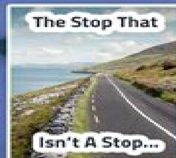
The Stop That Isn't A Stop...