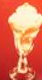
19. CHOCOLATE A swirl of chocolate ice cream topped with a cherry and a dusting of cocoa powder.