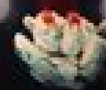
24. CHOCOLATE A swirl of chocolate ice cream topped with a cherry and a dusting of cocoa powder.