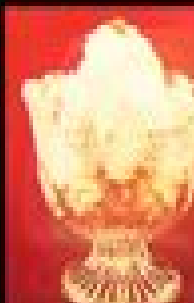
21. CHOCOLATE A swirl of chocolate ice cream topped with a cherry and a dusting of cocoa powder.