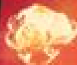
4. CHOCOLATE A swirl of chocolate ice cream topped with a cherry and a dusting of cocoa powder.