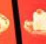
15. CHOCOLATE A swirl of chocolate ice cream topped with a cherry and a dusting of cocoa powder.