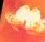
10. CHOCOLATE A swirl of chocolate ice cream topped with a cherry and a dusting of cocoa powder.