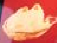
18. CHOCOLATE A swirl of chocolate ice cream topped with a cherry and a dusting of cocoa powder.