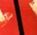
16. CHOCOLATE A swirl of chocolate ice cream topped with a cherry and a dusting of cocoa powder.