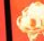
14. CHOCOLATE A swirl of chocolate ice cream topped with a cherry and a dusting of cocoa powder.