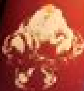
17. CHOCOLATE A swirl of chocolate ice cream topped with a cherry and a dusting of cocoa powder.