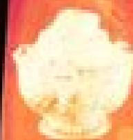
12. CHOCOLATE A swirl of chocolate ice cream topped with a cherry and a dusting of cocoa powder.