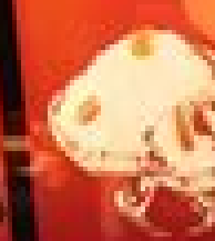
23. CHOCOLATE A swirl of chocolate ice cream topped with a cherry and a dusting of cocoa powder.