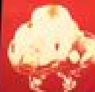
20. CHOCOLATE A swirl of chocolate ice cream topped with a cherry and a dusting of cocoa powder.