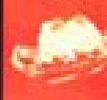
13. CHOCOLATE A swirl of chocolate ice cream topped with a cherry and a dusting of cocoa powder.